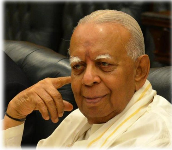
Hon. Rajavarothiam Sampanthan