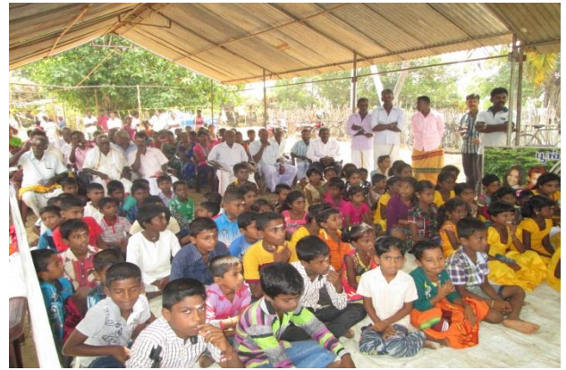
Punnyagrama Programme – Poonagary, Kilinochchi