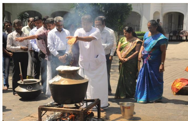
New Year Programmes – Sri Ponnampalawaneshwarar Temple Colombo - 13