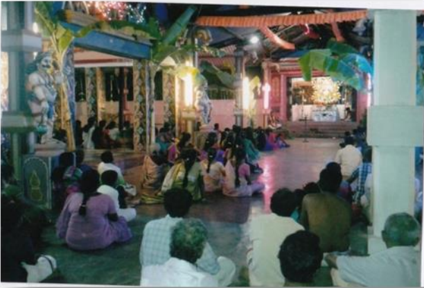
20.02.2015 in Ellupaikadavai Muniyappar Temple - Manthai West