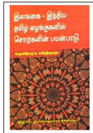
“Illangai, Inthiya Tamil Valkkukalil sotkalin Payanpadu”