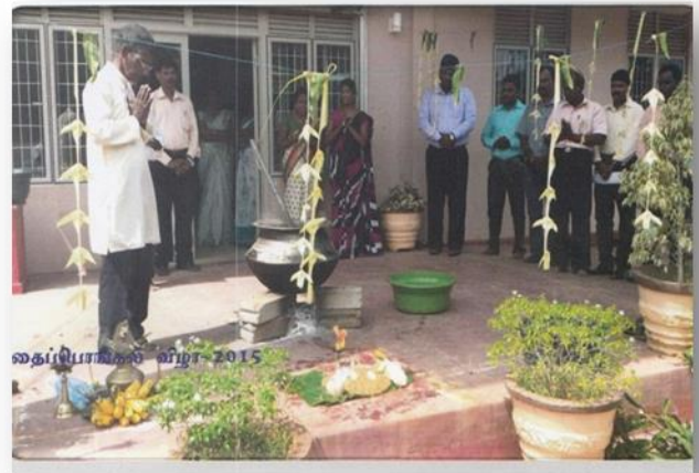
Thaipongal Festival – Puthukudiyiruppu