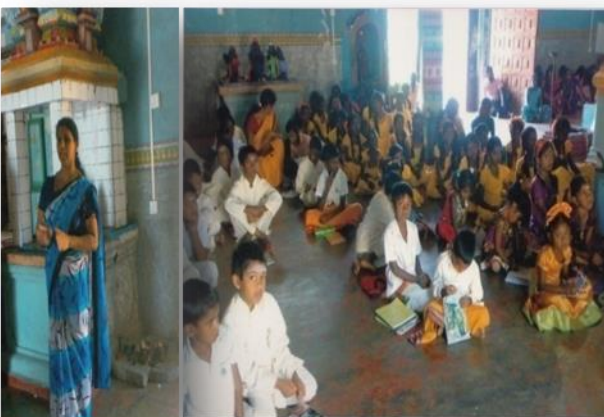
15.03.2015 in Athithiya Aranery School – Kandy