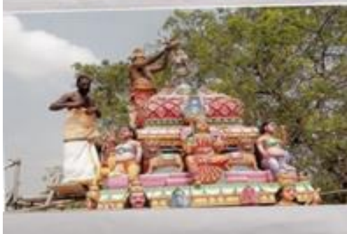
Eluppaikadavai Sri Siva Muthumariaama Kumbabisegam - Batticaloa