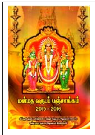
“Almanic” 2015 – 2016