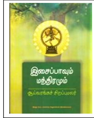
Published Research Souvenir – Research Seminar