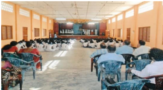
Thiurvalluvar Guru Pooja - Kandy