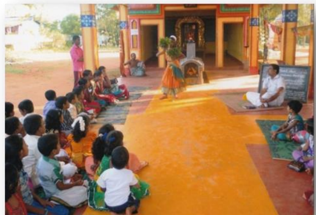
Thaipongal Festival – Muthumariyamman Temple - Vavuniva