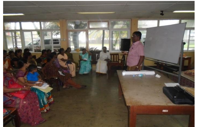
Residential Seminar to Aranery Teachers for the Final Examination – Ramakrishana Mission, Colombo