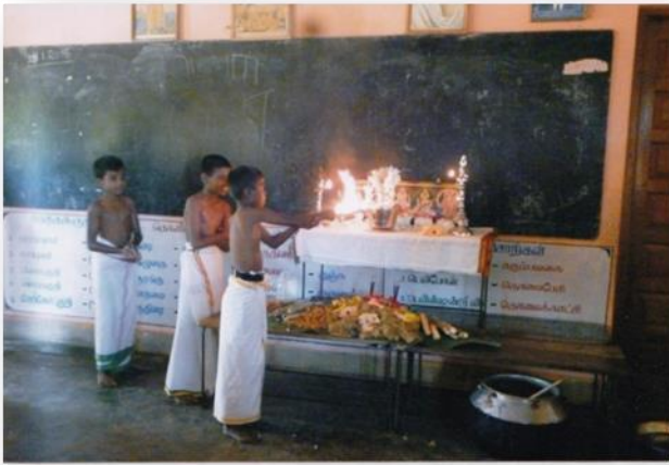
Thaipongal Festival – Arayampathy Aranery School