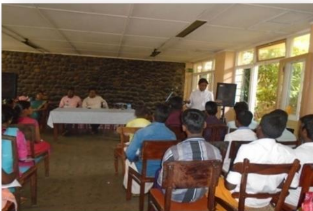
Residential Seminar to Dharmasiriyar – Ramakrishana Mission, Colombo