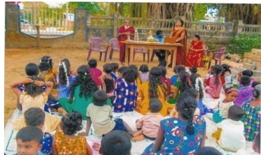
Kannappanayanar Guru Pooja – Pothuvil