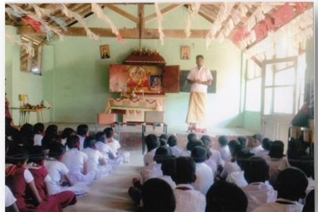
20.02.2015 in Uppukulam Sithivinayagar Temple - Mannar