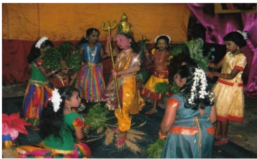
Cultural Programmes – Performed by Aranery Sturdents Ninthalalai Sri Muthumariamman Temple Kandy