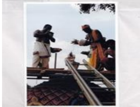
Palavi Sri Nagakaliamm Temple Kumbabisegam - Puttalam