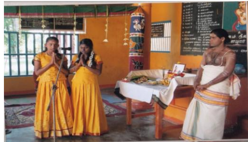
Kannappanayanar Guru Pooja - Thellipalai