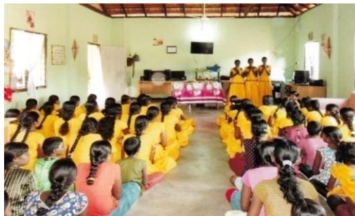
Karaikal Ammaiyar Guru Pooja - Kilinochchi