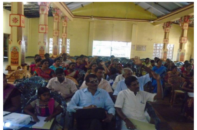
Seminar to Aranery Teachers in Jaffna