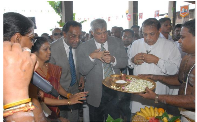
Navarathri Festival at Parliment