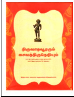
Published Last year Research essays book at Reserch Seminar