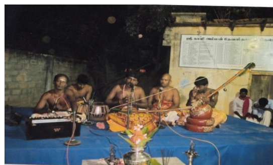
Cultural Programmes – Thirunelveli Sri Kaliyamman Temple Jaffna