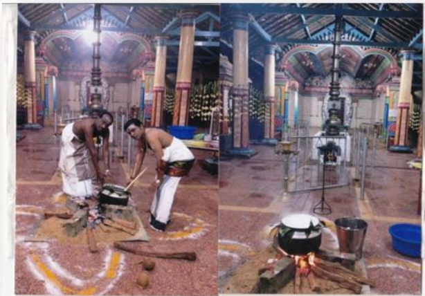
Thaipongal Festival – Kanthaswamy Temple - Kilinochchi