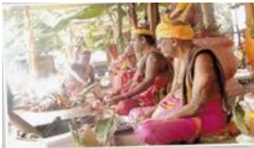
Photoes - XIV