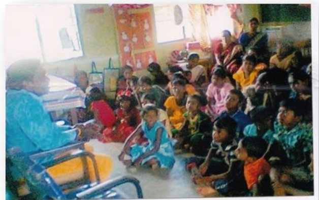
15.03.2015 in Andankulam Pillaiyar Kovil - Mannar