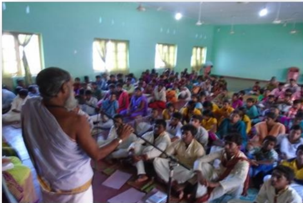
Residential Seminar to Aranery Teachers – Hindu Cultural Hall, Navatkudha