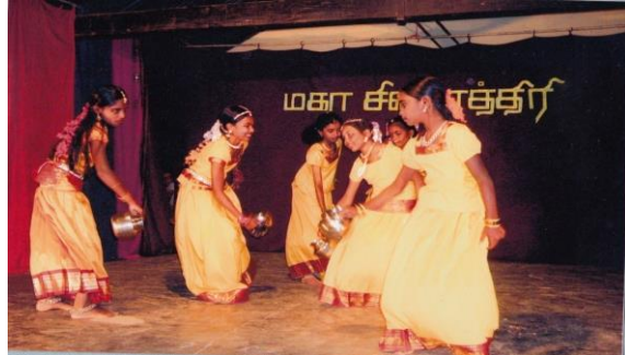
Cultural Programmes – Performed by Aranery Sturdents Badulla