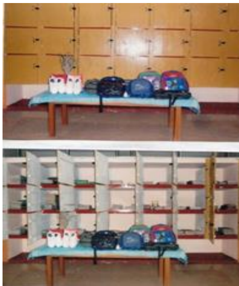
Financial Assistance for children home - Mattle Saratha Mission