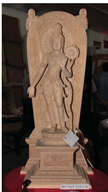
Traditional Handicraft Segment