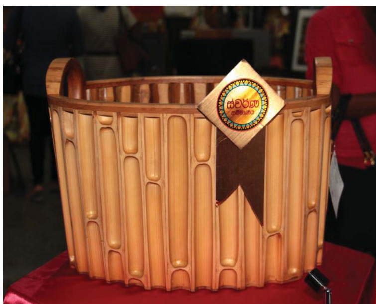
Modern Handicraft Segment