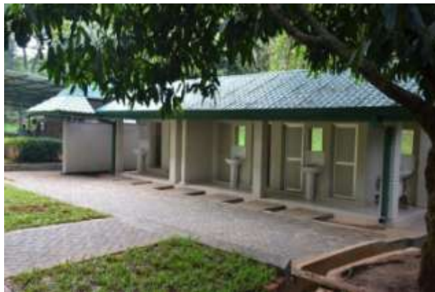
Renovated toilet building