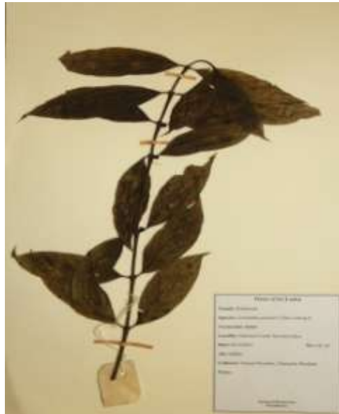
A sample of plant collected