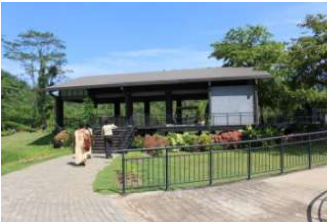
Fence and entrance (gate) completed at Seethawaka Wet Zone Botanic Gardens