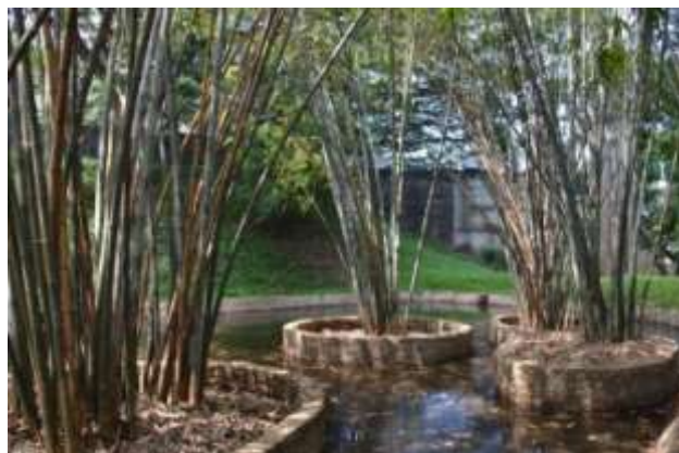
Established ponds at Royal Botanic Gardens