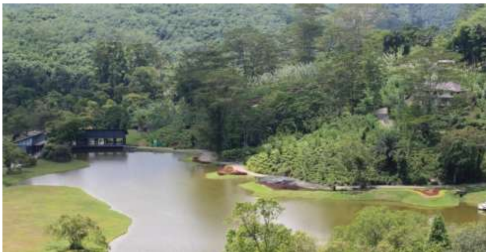
Tank and surrounding at Seethawaka Wet Zone Botanic Gardens