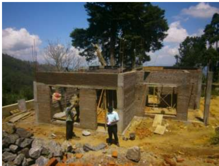
Staff official quarters on construction in Hakgala Botanic Gardens