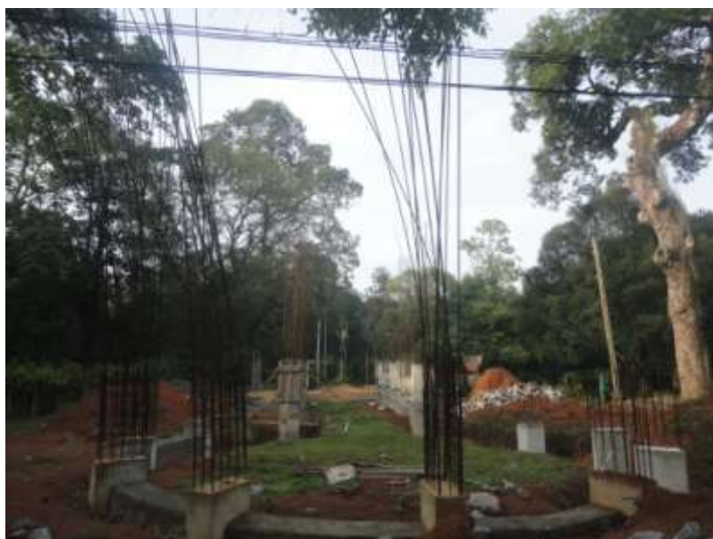
Construction of Orchid plant house in Gampaha Botanic Gardens