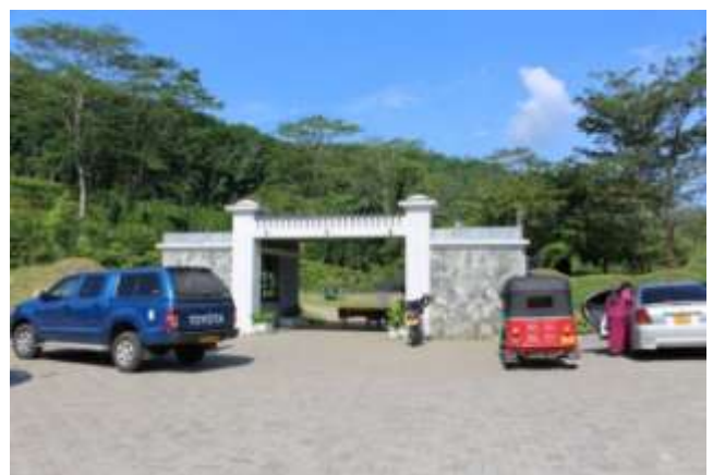
Vehicle park accomplished at Seethawaka Wet Zone Botanic Gardens