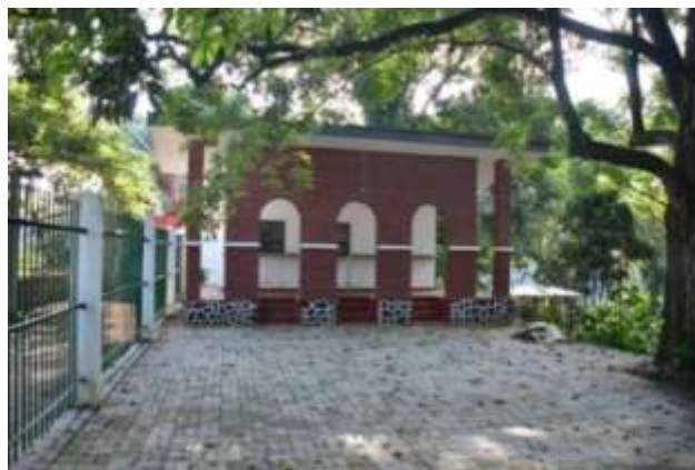
ticket counter at the Gannoruwa side