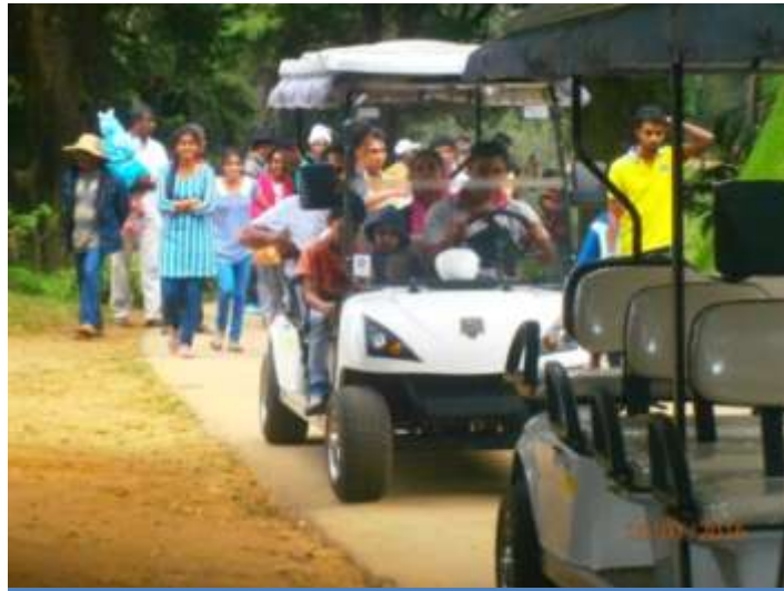
visitors using battery operated cars at Hakgala Botanic Garden

increased. Accordingly, Rs. 9 million had earned through income from battery operated cars during the year 2015. These cars have been given for use of visitors who visit Peradeniya Botanical Garden, Hakgala Botanical Garden, Gampaha Botanical Garden, Avissawella Botanical Garden and Hambantota Garden.