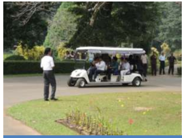
Visitors using battery operated cars at Peradeniya Botanic Garden