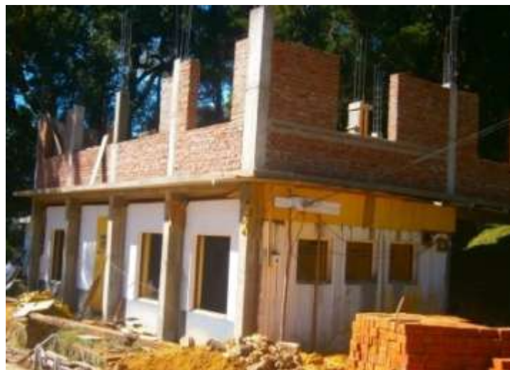
Constructions of Office Building At Hakgala Botanic Garden