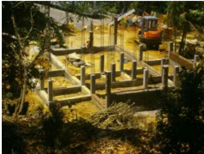
Construction of New entrance building at Hakgala Botanic Gardens