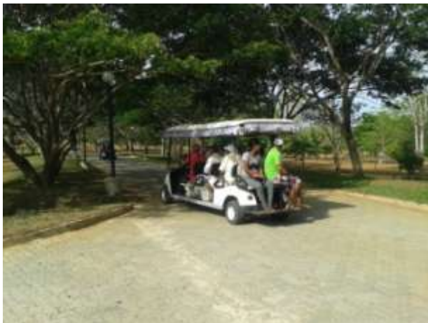
Visitors using battery operated cars at Hambantota Botanic Garden