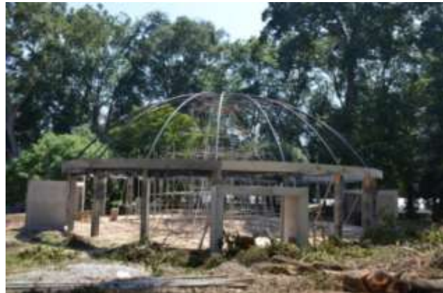
Plant House constructed in Royal Botanical Garden